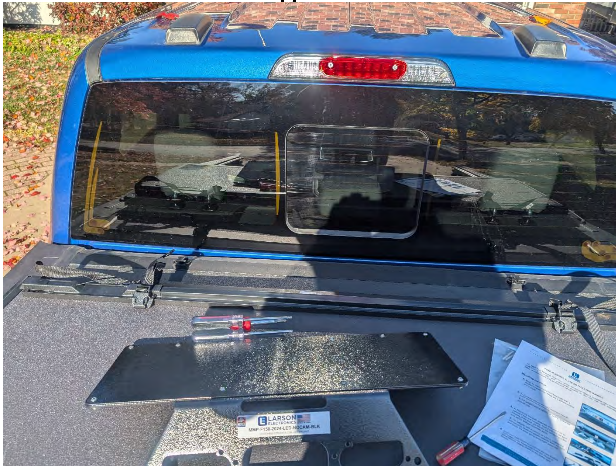
Larson Electronics Mounting Plate